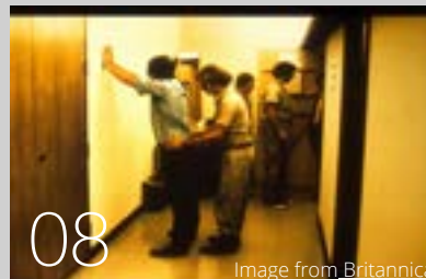
08